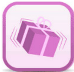
BIZARRE BAZAAR (18 YEARS +)

For advertising enquiries visit: http://futureofsex.net/advertise